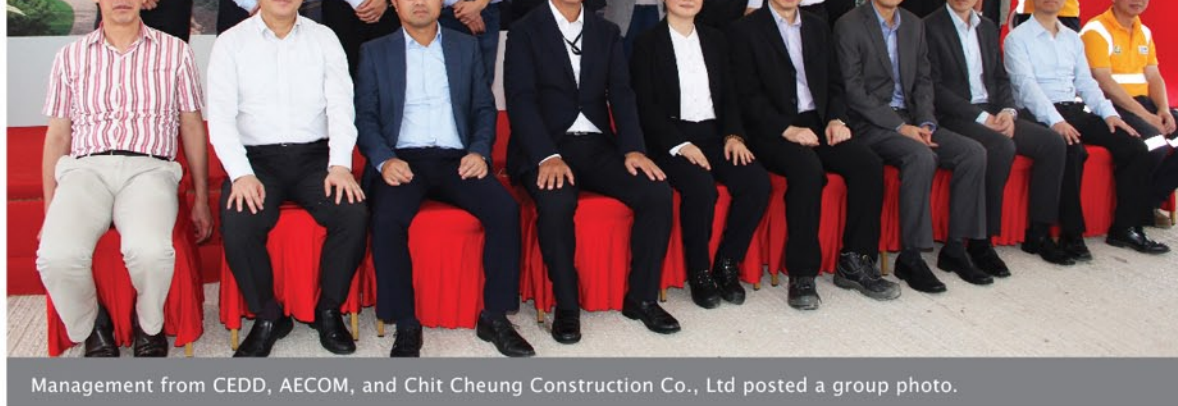
Management from CEDD, AECOM, and Chit Cheung Construction Co., Ltd posted a group photo.

The project has already been commenced on 30 November 2015 and various sections were scheduled to be completed between the end of 2017 and 2019. The scope of works includes construction of roads, elevated landscaped deck, noise barriers, footpaths, pedestrian streets, street lighting, traffic aids, drainage, sewerage, water-mains, landscaping and ancillary works at the former runway.