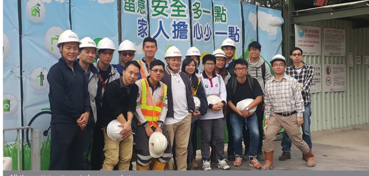
All the participants posted a group photo.

Sun Fook Kong is the main contractor of the project "Construction of Home Ownership Scheme Development at Sheung Lok Street, Homantin", and it has been commenced in 26 Feb 2015 and will be completed in early 2019.