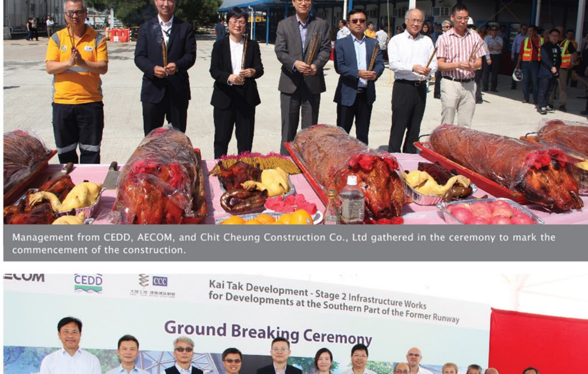
Management from CEDD, AECOM, and Chit Cheung Construction Co., Ltd gathered in the ceremony to mark the commencement of the construction.

The project "Contract No. KL/2014/01 - Kai Tak Development – Stage 2 Infrastructure Works for Developments at the Southern Part of the Former Runway" undertaken by CEC – CCC Joint Venture, held a ground breaking ceremony on 12 November 2016. Management from CEDD, AECOM and CEC – CCC Joint Venture gathered in the ceremony to mark the commencement of the construction, and wish the construction goes smoothly and well.