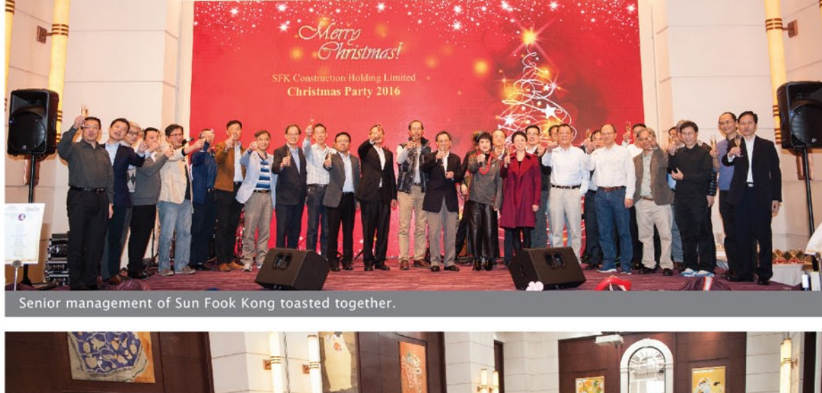
Senior management of Sun Fook Kong toasted together.

To celebrate the Christmas, Sun Fook Kong organized a Theme Park Christmas Party at Cordis Hotel on 23 December 2016. More than a hundred colleagues from Hong Kong and Mainland China joined the party and shared a happy moment.