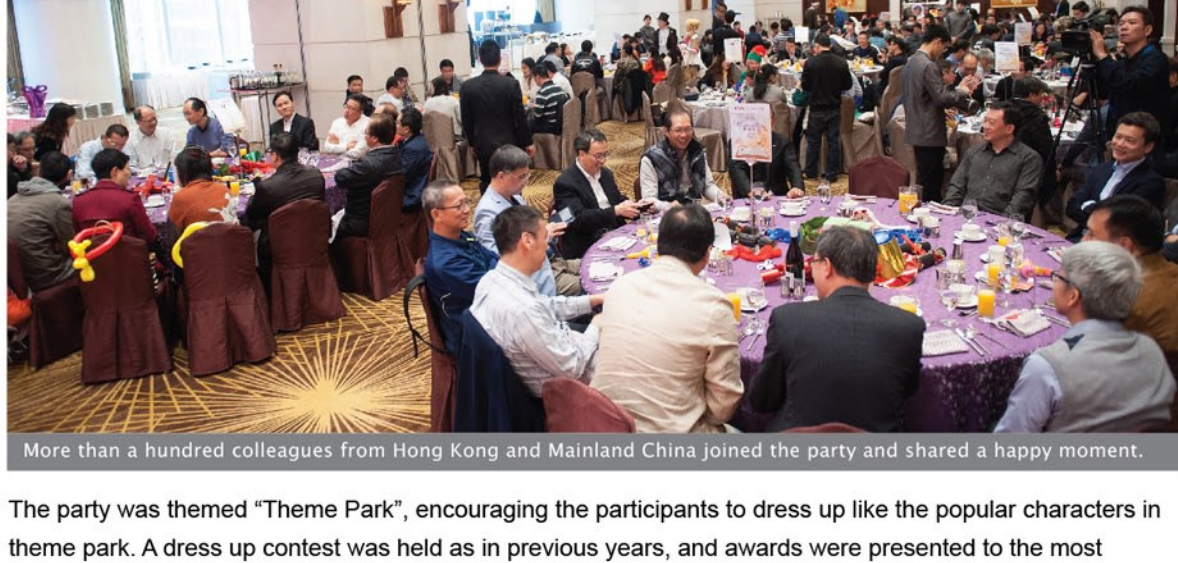
More than a hundred colleagues from Hong Kong and Mainland China joined the party and shared a happy moment.

The party was themed "Theme Park", encouraging the participants to dress up like the popular characters in theme park. A dress up contest was held as in previous years, and awards were presented to the most impressively dressed cosplayers. Besides a delicious lunch buffet, the company had arranged a live band show and lucky draw session for all guests to share the joy of Christmas.