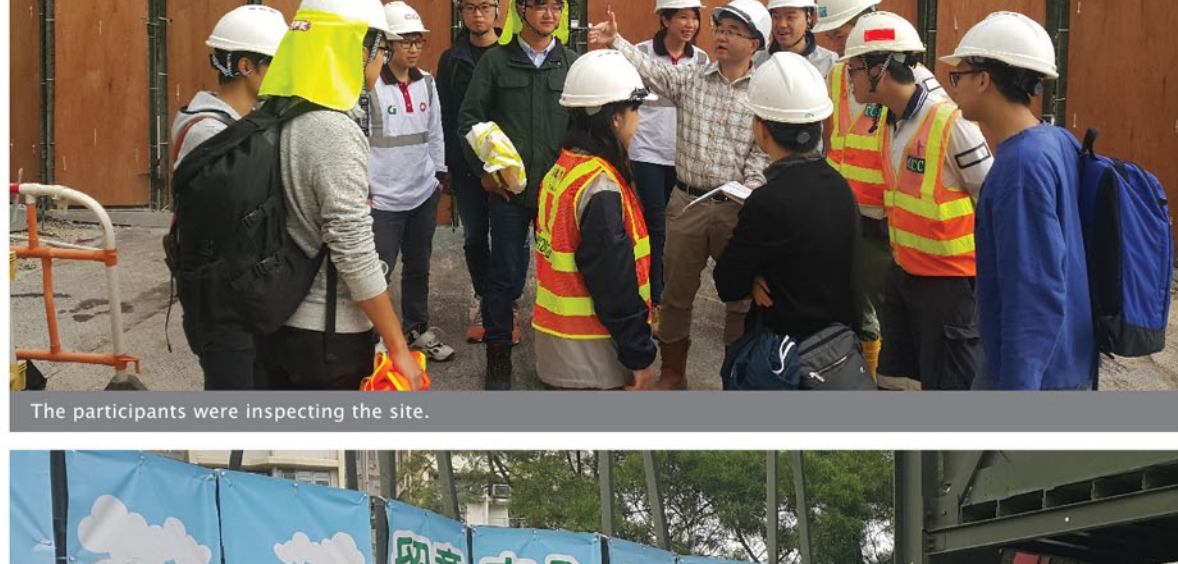
The participants were inspecting the site.

In order to develop the staff's expertise, Sun Fook Kong organized an in-house technical site visit to Hong Kong Housing Authority Project "Construction of Home Ownership Scheme Development at Sheung Lok Street, Homantin" on 3 December 2016. A total of 19 SFK staff from different sites participated in this site visit and they all had learned a lot.