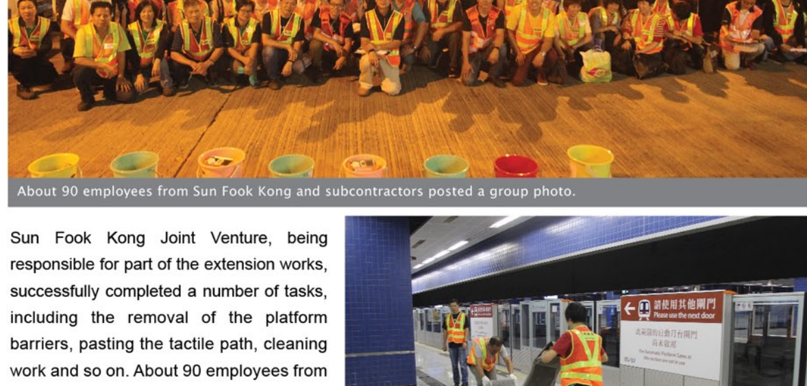
About 90 employees from Sun Fook Kong and subcontractors posted a group photo.

Sun Fook Kong Joint Venture, being responsible for part of the extension works, successfully completed a number of tasks, including the removal of the platform barriers, pasting the tactile path, cleaning work and so on. About 90 employees from Sun Fook Kong and subcontractors arrived at Shek Mun MTR Station at 10:00 pm on 19 Nov. After a briefing with the team leaders, the workers of each team were assigned to the 9 stations along the Ma On Shan Line and completed the works according to the detailed schedule. All works were successfully completed at 5 am on 20 Nov.